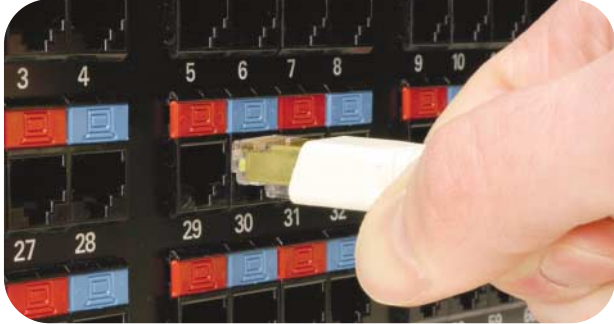
RJ-45 plug fits all standard RJ-45 equipment.