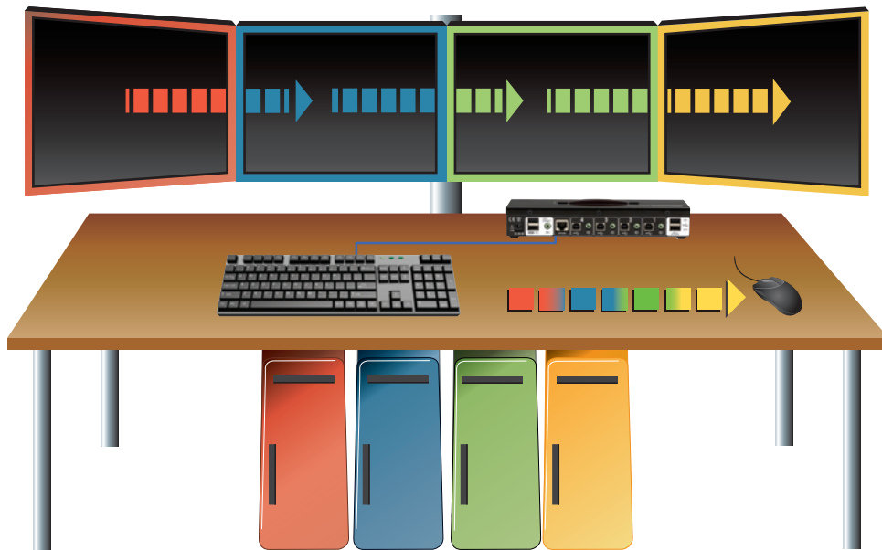
Switching ports with the ServSwitch Freedom is as simple as moving your mouse cursor over the connected monitors' X and Y borders. You can also use "quick-fire" hotkey or front-panel switching

PCs, and all you need to do is configure your screen layout. Switching ports is as simple as moving your mouse cursor over the screens' X and Y borders.